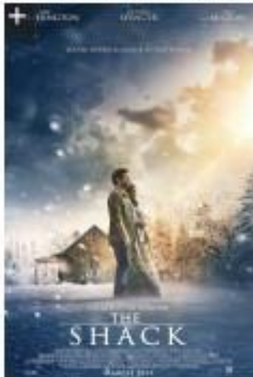
Week 3 - Discussing March 26th