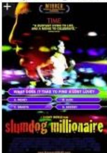
Week 5 - Discussing April 9th