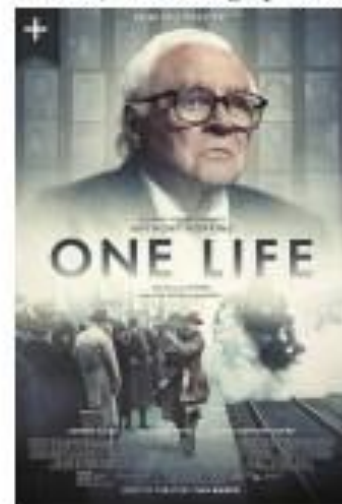
Week 6 - Discussing April 17th*