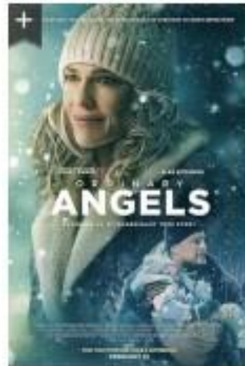
Week 2 - Discussing March 19th