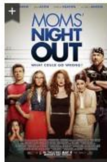
Week 4 - Discussing April 2nd